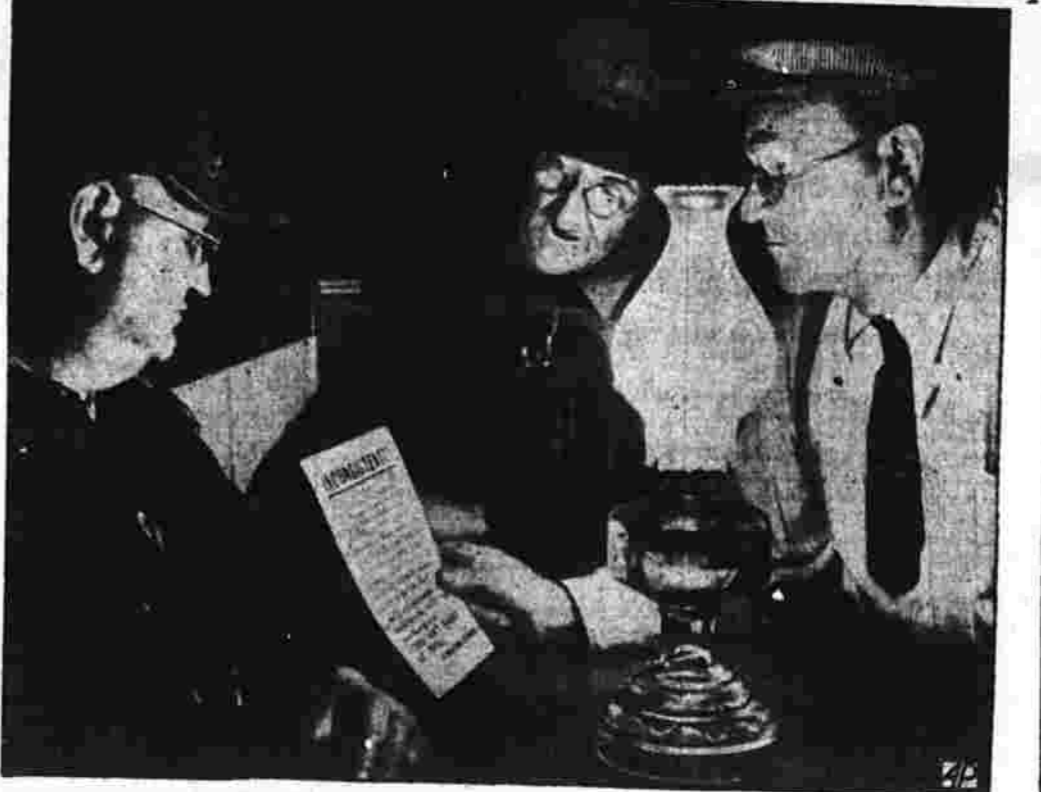
They, Mr. citizens were plunged in darkness when the Arkansas-Missouri Power Corporation and Homer Bone read a pamphlet issued in the night. By order of the Public Service Commission, the power company said they would resume service temporarily, however.